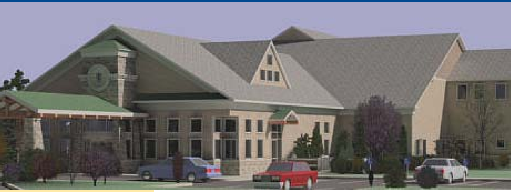
Artist rendering of our new hospital

NORTHSTAR VETS® Veterinary Emergency Trauma & Specialty Center Leading the Way.